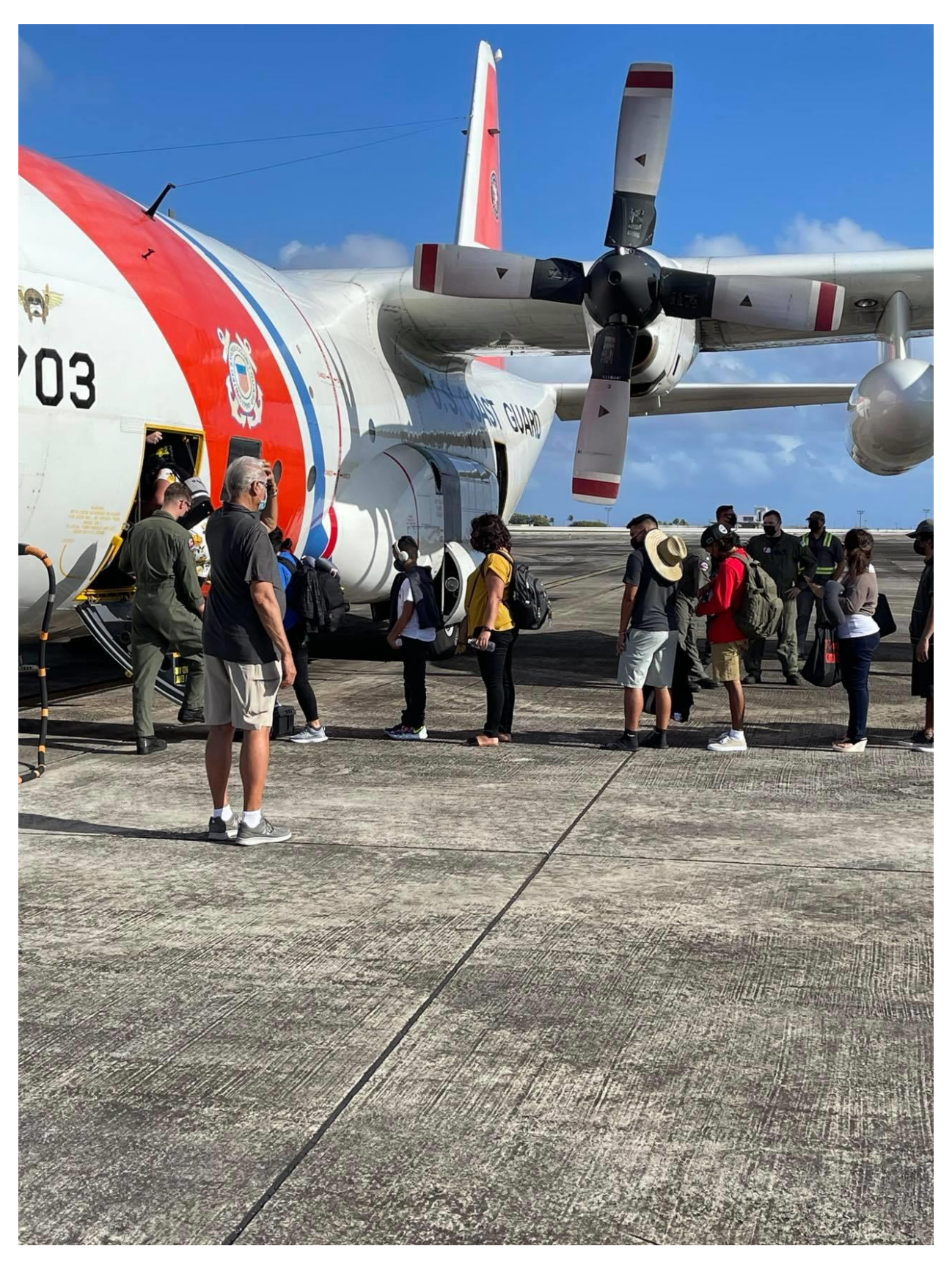
Pictured Above: Repatriating citizens enter the aircraft