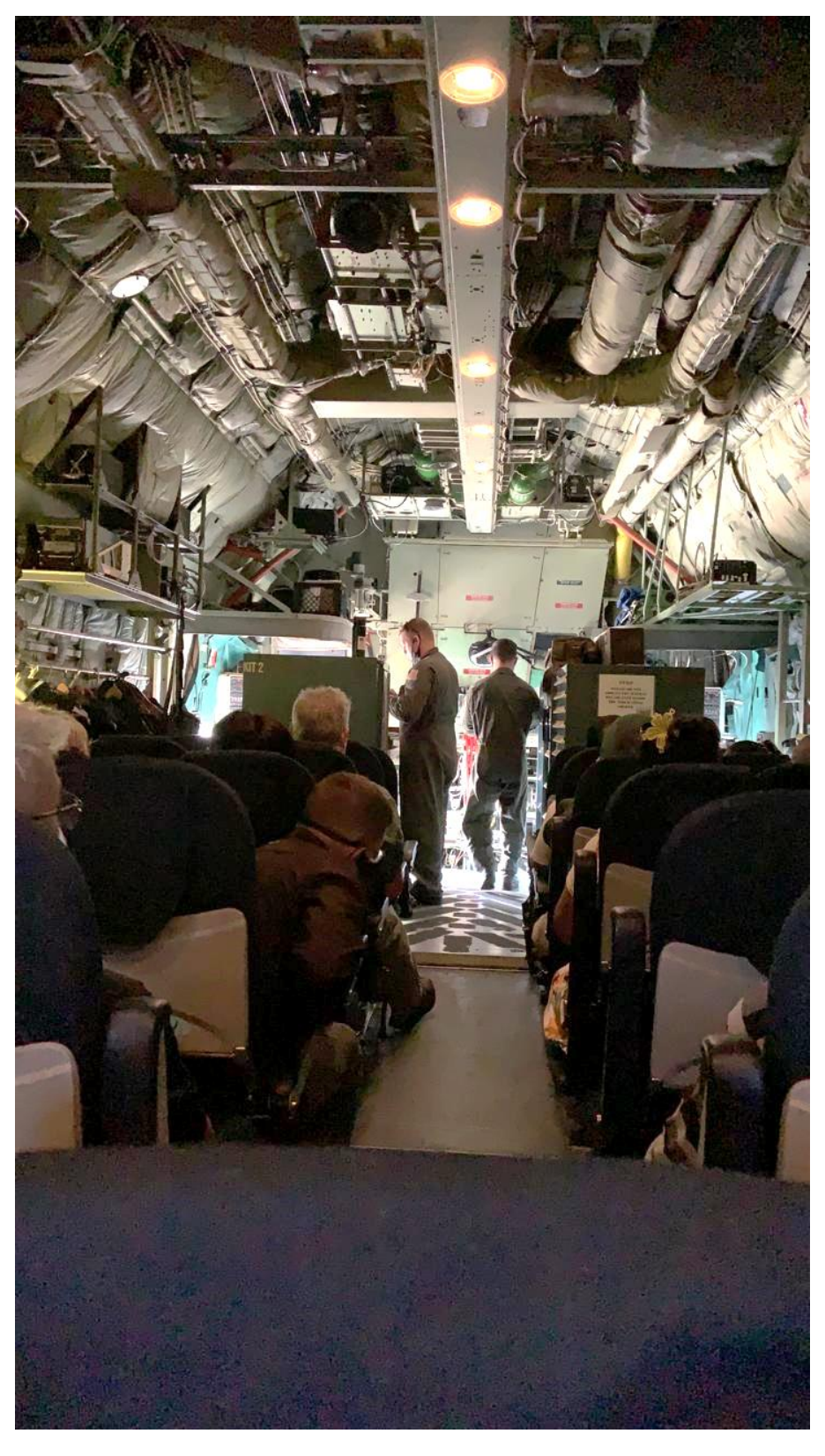
Pictured Above: FSM citizens prepare for their flight home after being stranded abroad for an average period of approximately fourteen months