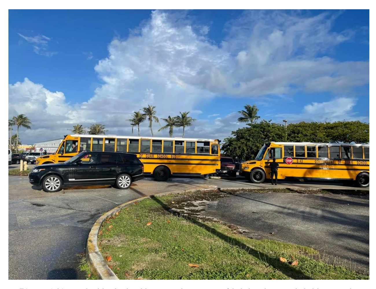
Pictured Above: Sanitized school buses, under escort, safely bring the stranded citizens to the aircraft