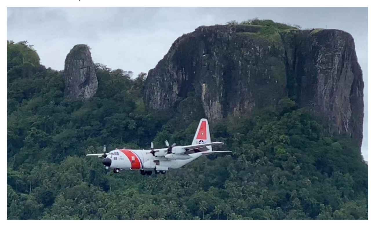
Pictured Above: A U.S. Armed Forces asset repatriates stranded FSM citizens ( Photo Courtesy of the Pohnpei Surf Club —For More Information, Visit <a href="http://pohnpeisurfclub.com/">http://pohnpeisurfclub.com/</a>)