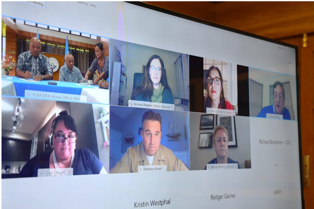
Pictured Above: President Panuelo and Vice President George listen to the Nation's American allies discuss the COVID-19 vaccine