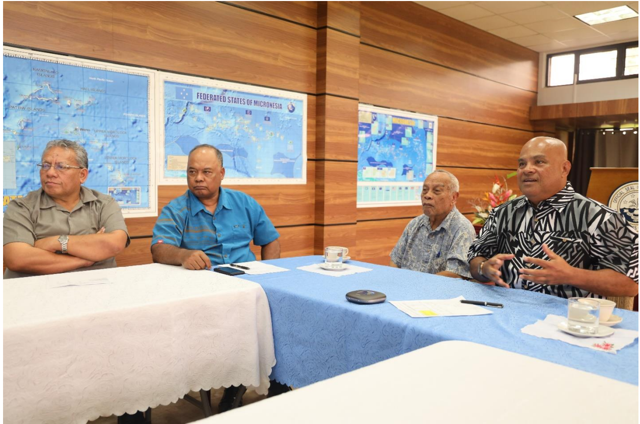
Pictured Above: President Panuelo expresses the Nation's sincere appreciation for its Enduring Partnership with the United States, and its enthusiasm to receive the COVID-19 vaccine as developed by Moderna