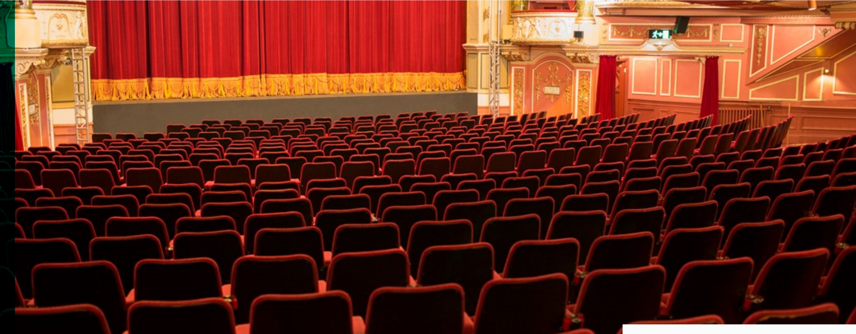
Teaterföreställningar omfattas av reglerna som ska dämpa spridningen av covid-19.