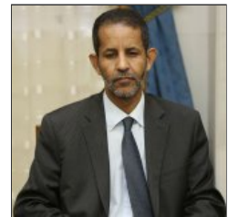
the Prime Minister, Mr. Ismaïl Ould Bedda Ould Cheikh Sidiya